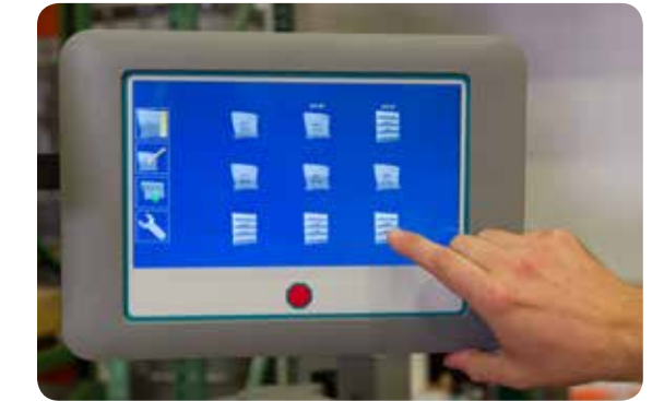
Industrial Grade Touch Screen Display