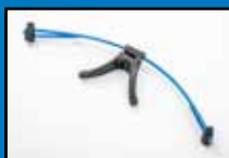
ASM Y-clip/Nylon Cord/ Adjustment plugs (PB2145) P/N 34702501