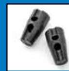
Black Adjustment Plugs P/N 34100563