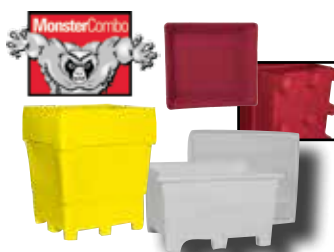
Single Wall Bins