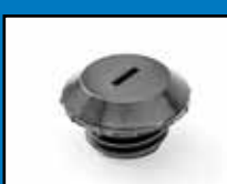
Nylon Wear Pads P/N 23000069