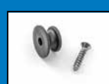
Nylon Knob & SS screw for securing rubber strap P/N 34100562