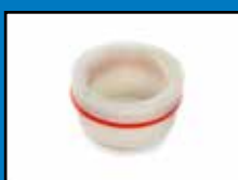
2" Adapter (converts to 1.5" female NPT) P/N 34100566